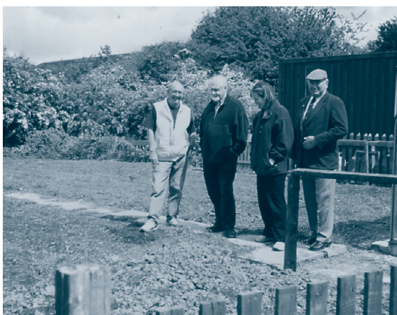
Inspecting a plot for reletting

Measures to improve the reliability of waiting lists are therefore to be welcomed,