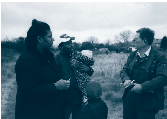
A new plotholder signs up...

any guests on site where these are permitted, and that plot-sharers be asked to leave the site if plotholders alone have right of access.